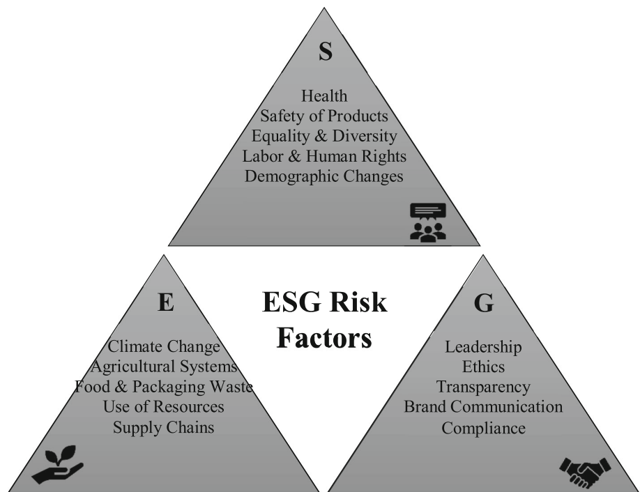
FIGURE 1 Overview of ESG risk factors in the food industry.

potential risks to the food supply of future generations (Smetana et al., 2020).