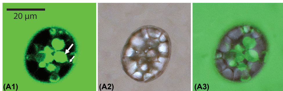
Figure 3. Fluorescein staining. (a) Unfixed Achromatium cells with naturally occurring empty cavities were immediately penetrated by the hydrophilic dye fluorescein, and revealed green-fluorescent signals at the same locations, and with reminiscent shapes, as the missing calcium carbonate bodies. (a1) Fluorescein signal in green, big arrow pointing at a shape reminiscent and co-localized with a calcium carbonate cavity, small arrow pointing at a thin green-fluorescent channel-like structure; (a2) transmitted light image of the same cell; (a3) overlay of a1 and a2.

In agreement with previous observations by Head et al. (2000b) and Salman et al. (2015), our localization experiments of DNA, membranes, and cytoplasmic proteins confirmed that the cytoplasm of Achromatium is restricted to a thin layer underneath