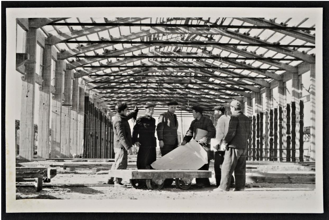
Workers on the construction field. (Nov. 1955 - Apr. 1959?) BA-B, Bestand DC 20, Band 1326.

a large-scale housing complex (Wohnkomplex) for Hamheung citizens who lost their houses and to establish infrastructures for the city that could create stable living conditions. Therefore, it focused on rebuilding housing complexes, roads, underground waterworks, bridges, drainage and so on. The DAG succeeded in completing 400 households in the very first year and a factory to produce basic construction materials. 111