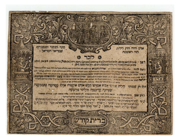
Fig 1: Inventarnummer: JMP 178.801.

Locality of Geniza: Luže (Eastern Bohemia). Inventory number: JMP 178.801. Type and extent: Manuscript on paper, 1 leaf. Condition: Fairly good, restored. Language: Hebrew, Yiddish. Title: –. Author: Unknown. Locality: [Sulzbach?]. Year: [18<sup>th</sup> century].