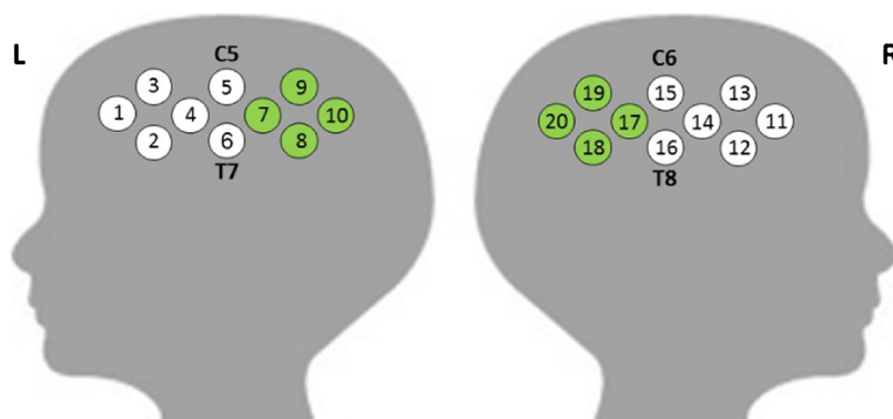
Fig. 1. Location of the NIRS channels over the left and right hemisphere, relative to 10–20 positions T7 and T8. Channels within the Region of Interest are marked green.

To assess Negative Affect in infants, parents were asked to complete the Infant Behavior Questionnaire – Revised – Short form (Gartstein and Rothbart, 2003; Putnam et al., 2014). This questionnaire consists of 91 questions regarding the behavior of the infant in a multitude of possible situations over previous week(s). Questions are rated on a 7-point Likert-scale (1 = never; 7 = always). Four scales are used to measure Negative Affect (25 questions): fear, distress to limitations, rate of recovery from distress, and sadness (Cronbach's \alpha in our sample was 0.75). Negative Affect thus gives an indication of how frustrated or negative infants react to situations, people and their general environment with a minimum score of 1 and a maximum of 7, with higher scores indicating higher level of Negative Affect . Mean score on Negative Affect was 2.5 (range: 1.33–4.07; SD = 0.66) for the infants included in the analysis.