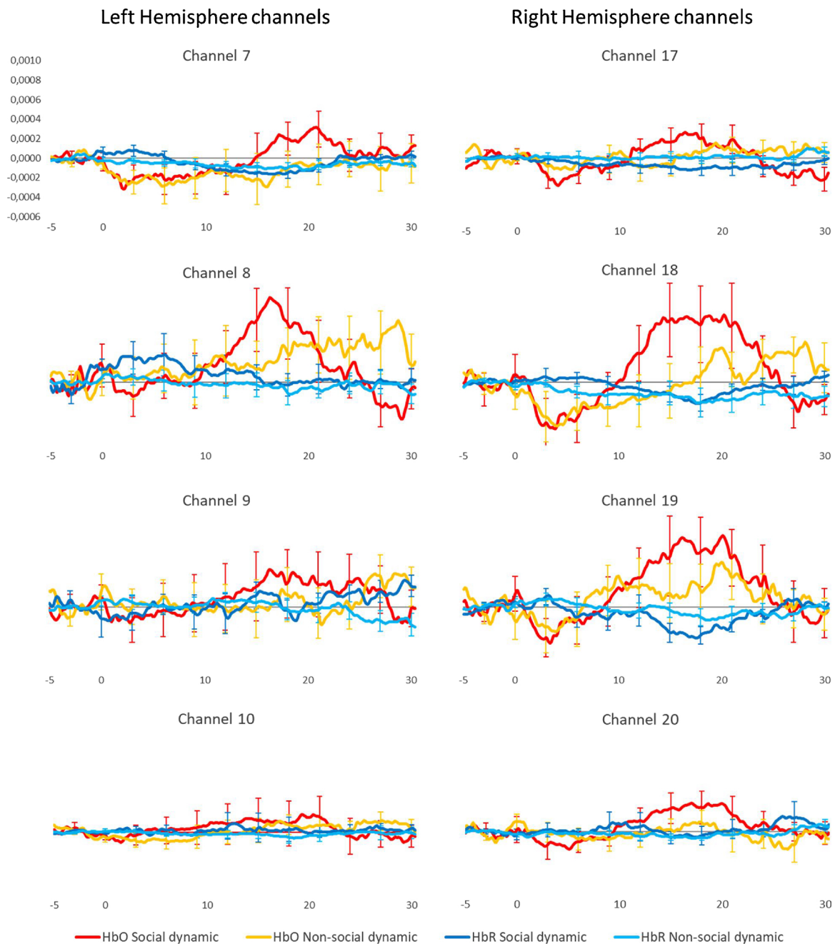
Fig. 2. Grand mean average time courses with Standard Error of HbO and HbR changes in millimolar (mM) as a function of time (stimulus block starts at 0) for each of the experimental conditions in the posterior temporal channels.

these children as there was no association between Negative Affect and either the number of excluded infants or the number of valid trials or channels within the included infants.