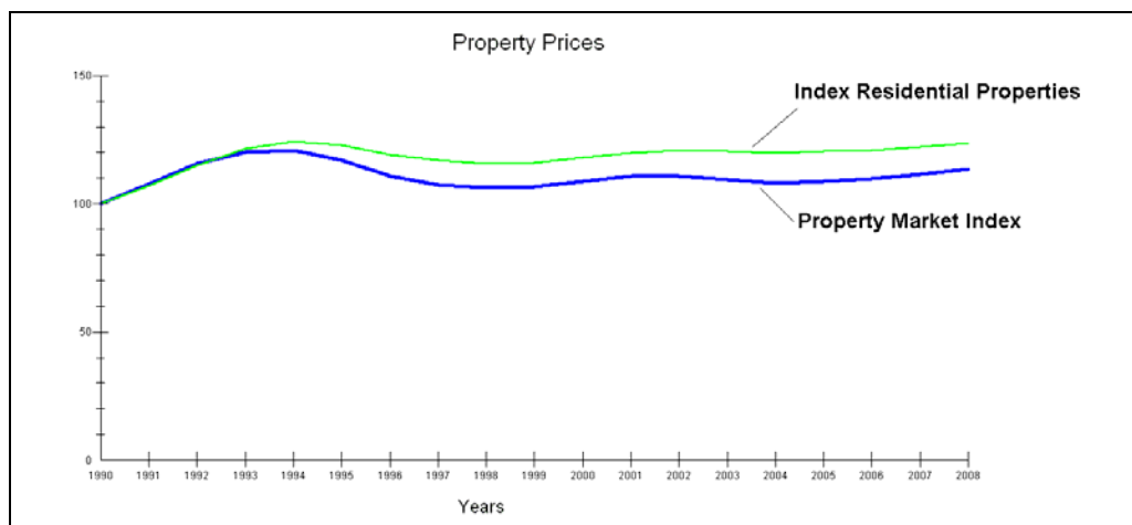
Figure 2: Property Prices in Germany 1990 – 2008

The sharp rise in stock prices in the second half of the 1990s and from 2003 to 2007 have received much attention on the influence of stock market on aggregate economy, especially the corporate investments. In the last year, the stock prices fell dramatically. The German stock market index (DAX) halved in value. How much of this decline has been transmitted into real economic activity?