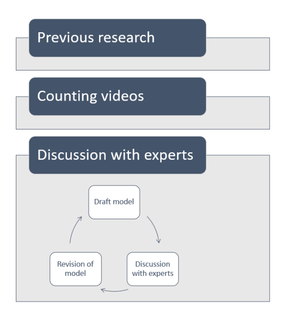
Figure 1: Coding process for creating video genres