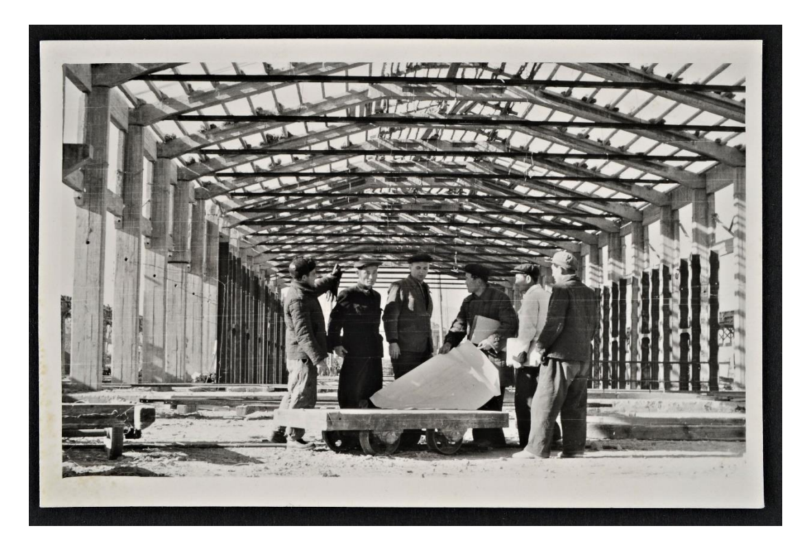
Workers on the construction field. (Nov. 1955 - Apr. 1959?) BA-B, Bestand DC 20, Band 1326.

a large-scale housing complex (Wohnkomplex) for Hamheung citizens who lost their houses and to establish infrastructures for the city that could create stable living conditions. Therefore, it focused on rebuilding housing complexes, roads, underground waterworks, bridges, drainage and so on. The DAG succeeded in completing 400 households in the very first year and a factory to produce basic construction materials.<sup>111</sup>