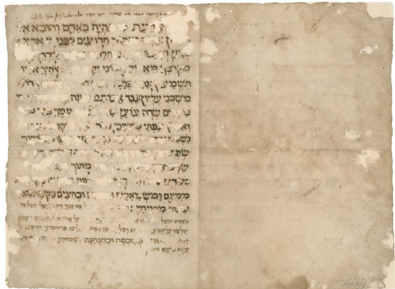
Fig. 3: Inventarnummer: JMP 178.816.

Locality of Geniza: Rychnov nad Kněžnou (Eastern Bohemia).