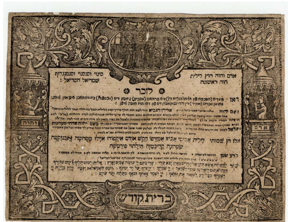
Fig. 1: Inventarnummer: JMP 178.801.

Locality of Geniza: Luže (Eastern Bohemia).