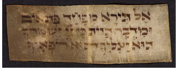
Fig. 2: Inventarnummer: JMP 177.922.

Locality of Geniza: Luže (Eastern Bohemia).