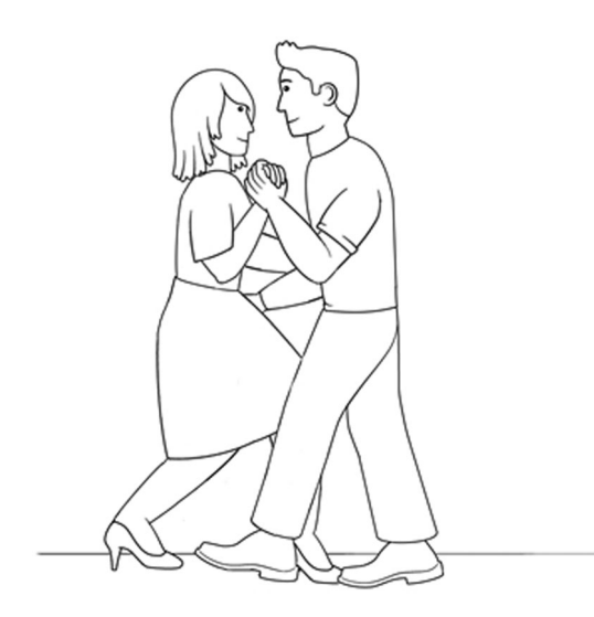
Figure 1. Example of a black-and-white line drawing used as target picture.

comment section that was provided to write down alternative verbs they considered. Their feedback was used to revise the drawings and tested again. Three web-based experiments with a total of 104 participants were performed.