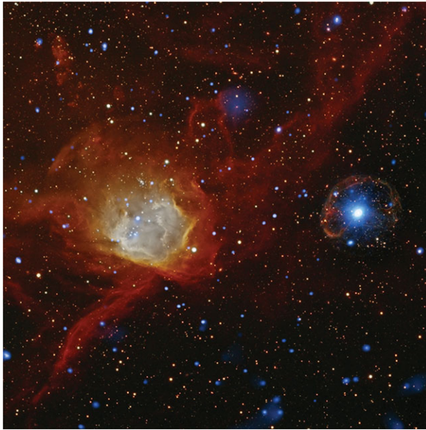
Figure 1. Combined X-ray (blue) and optical (red, yellow) image of NGC 602 and the SNR around the X-ray pulsar SXP 1062. North is up, east is to the left. Image size is 14' , see http://chandra.harvard.edu/photo/2011/sxp1062/

In this canonical model, long periods in excess of 1000 s can be achieved if B > 10^{14} G or \dot{M} < 10^{12} \text{g s}^{-1} . On the other hand, a new model for wind accretion (Shakura et al. 2012) allows long spin periods and high period derivatives even for standard magnetic fields. The model predicts specific correlations between the behavior of the spin and luminosity. An alternative model to explain long-period pulsars with P_{\text{spin}} \gg P_{\text{eq}} comes from Ikhsanov (2007), who postulates that prior to the accretion powered phase, a subsonic propeller phase may take place. Steady accretion under the condition P_{\text{spin}} > P_{\text{eq}} can be realized when the cooling of the envelope plasma dominates the energy input.