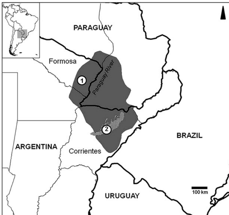
Figure 1. Map showing the present distribution of the Strange-tailed Tyrant (grey area) from Di Giacomo et al. (2011a). Numbers indicate the location of the two populations included in this study: 1) 'Reserva Ecológica El Bagual', Formosa Province, and 2) 'Reserva Natural del Iberá', Corrientes Province.

The aim of this study was to analyse the genetic variability and the genetic structure of the main population and one isolated Argentinean population of the Strange-tailed Tyrant, using both mtDNA and microsatellite molecular markers. These markers differ in mutation rates and mode of inheritance and provide essential information about population history and demographics (Wayne and Morin 2004). Current conservation and management efforts are focused on preserving