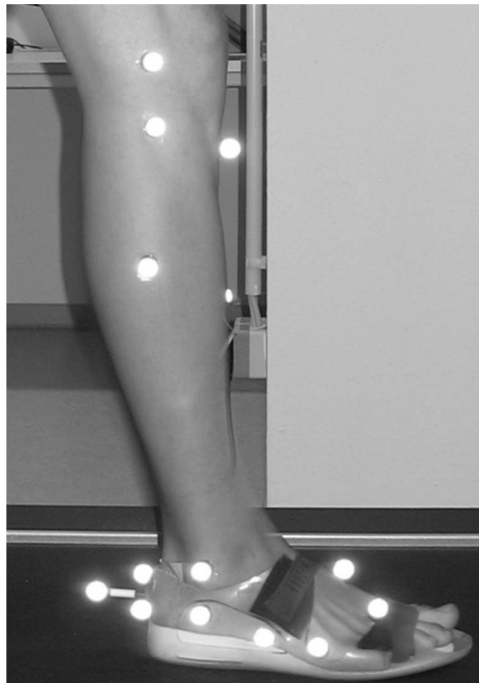
Fig 1. Subjects' lower extremity and foot in customised silicon slippers prepared with skin-based markers following the 'Oxford Foot Model' guidelines.

Six infrared cameras (Vicon MX 3, Vicon Motion Analysis Ltd., Oxford, UK) with a sampling frequency of 200 Hz were used to capture motion. Marker setup preparation consisted of 28 reflective skin markers (Ø 14 mm) following the 'Oxford Foot Model' guidelines [24–26]. Seventeen markers were placed on the lower right leg, 13 of them on the right foot (Fig 1).